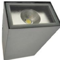
Unfixing Ceiling Board